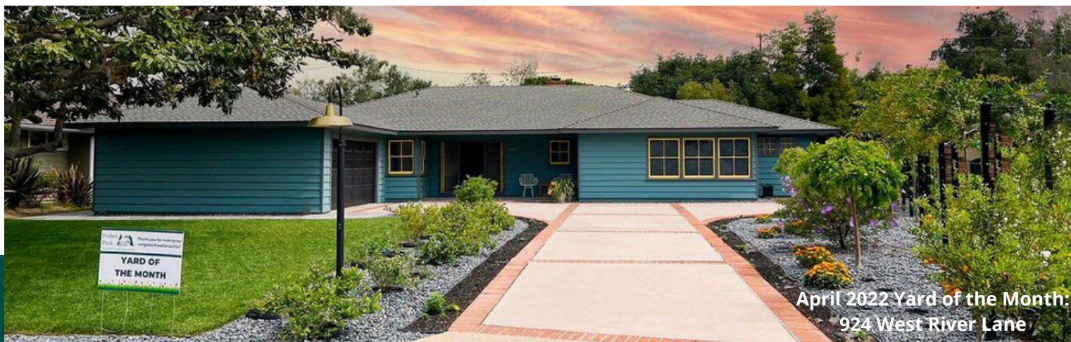
April 2022 Yard of the Month: 924 West River Lane